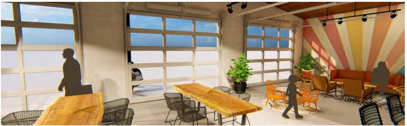
Orange Cup Java Station | Galesburg, IL