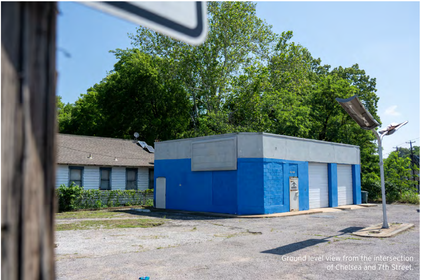
Ground level view from the intersection of Chelsea and 7th Street.