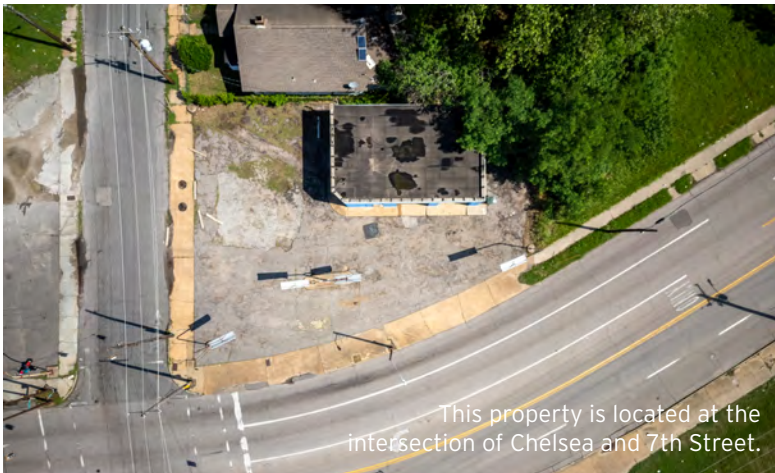
This property is located at the intersection of Chelsea and 7th Street.