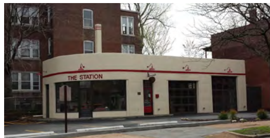
The Station St. Louis, MO