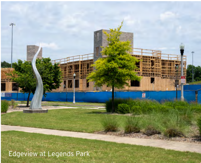
Edgeview at Legends Park

This RFP represents an important opportunity to revitalize a vacant property and bring light commercial, community-serving retail, or a small mixed-use development to the heart of Bickford. The CRA is excited to partner with an experienced development team to bring this vision to reality.