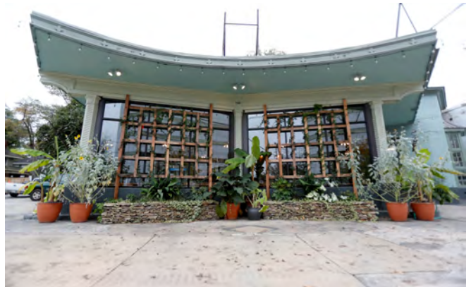
Tamboli's Pasta & Pizza | Memphis, TN