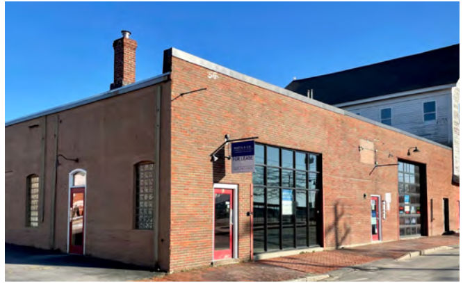
Brickyard Hollow Brewing | Yarmouth, ME