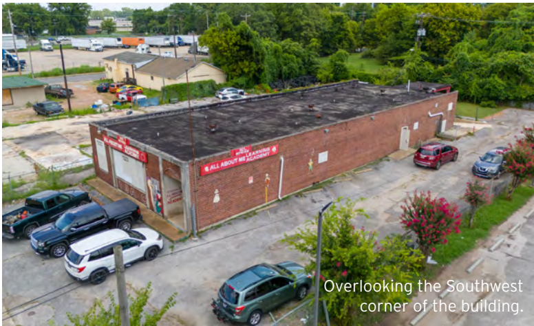
Overlooking the Southwest corner of the building.