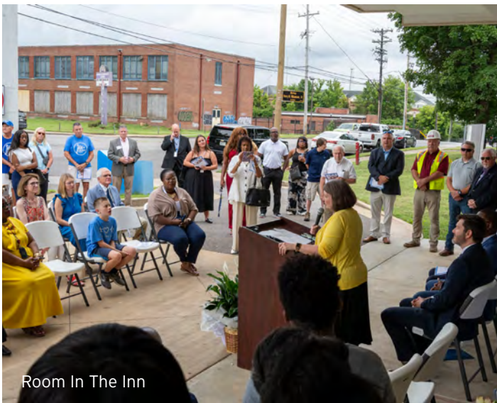
Room In The Inn