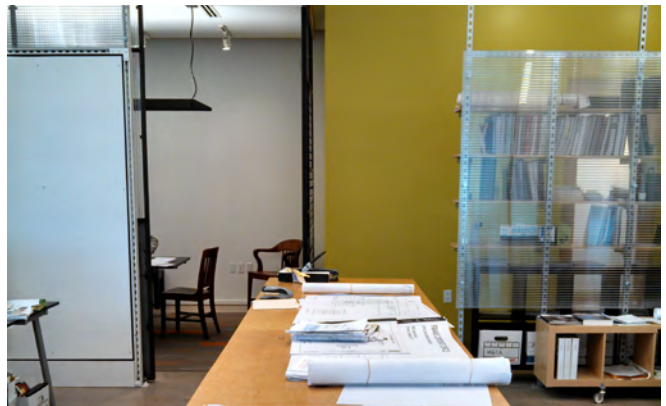
Melpark Office | Nashville, TN