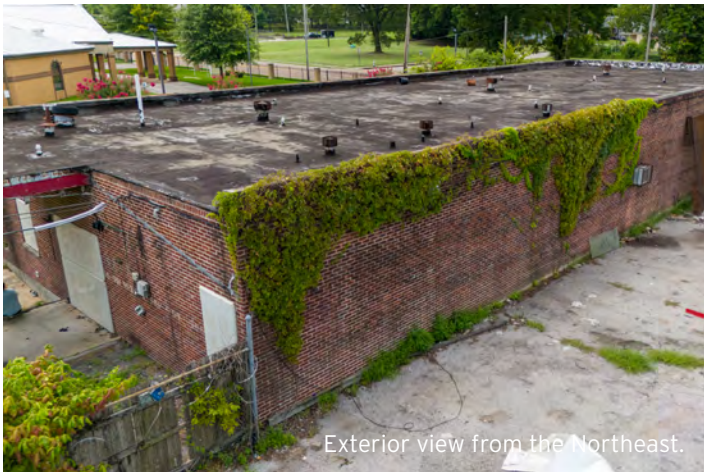
Exterior view from the Northeast.

If public funding or incentives are required to fill a financing gap, the CRA may be able to provide funding for the project.