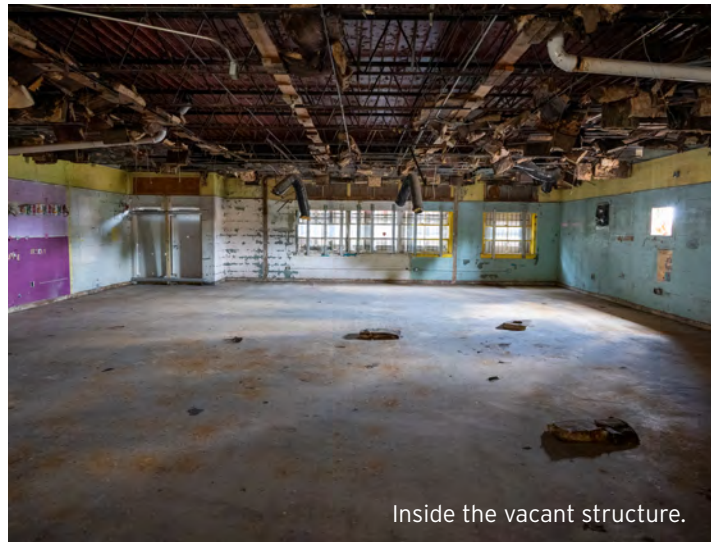
Inside the vacant structure.