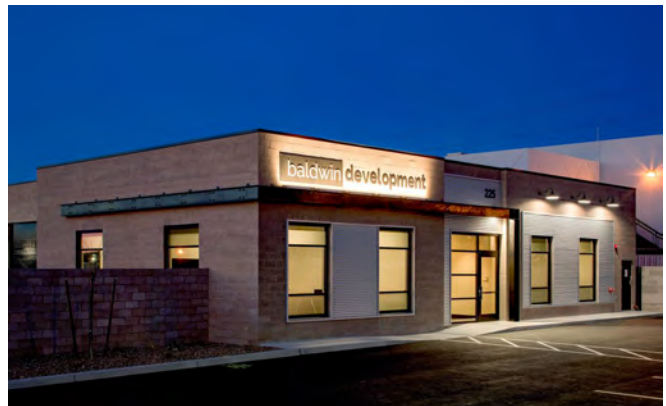
Baldwin Development | Las Vegas, NV