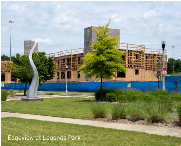
Edgeview at Legends Park

This RFP represents an important opportunity to revitalize a vacant commercial building and bring vibrancy to the Thomas Street corridor. The CRA is excited to partner with experienced development teams to bring this vision to reality.