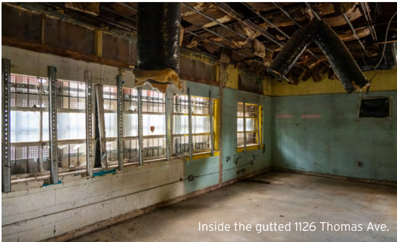
Inside the gutted 1126 Thomas Ave.