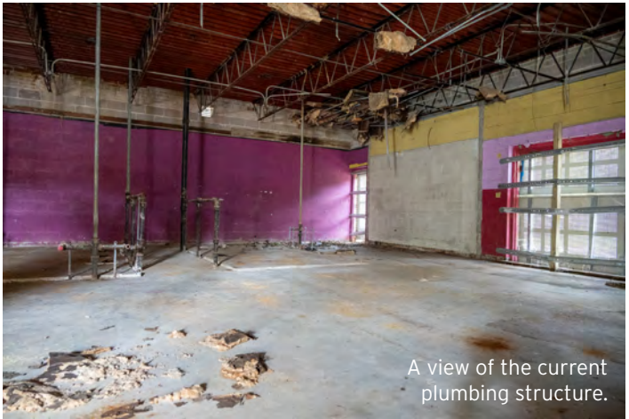
A view of the current plumbing structure.