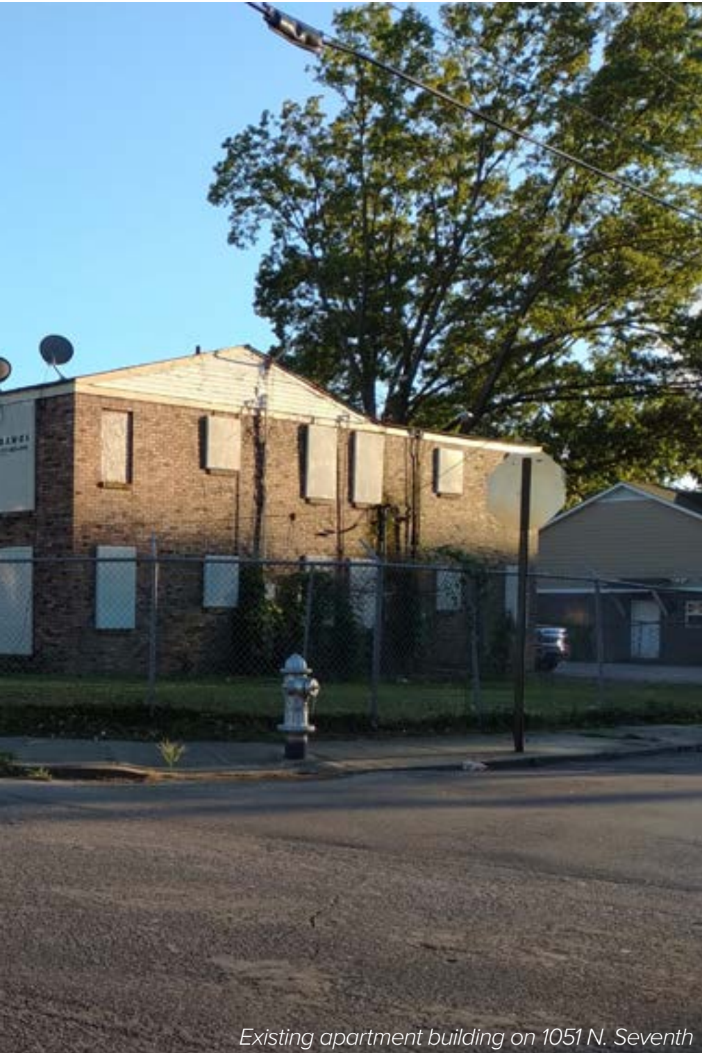
Existing apartment building on 1051 N. Seventh